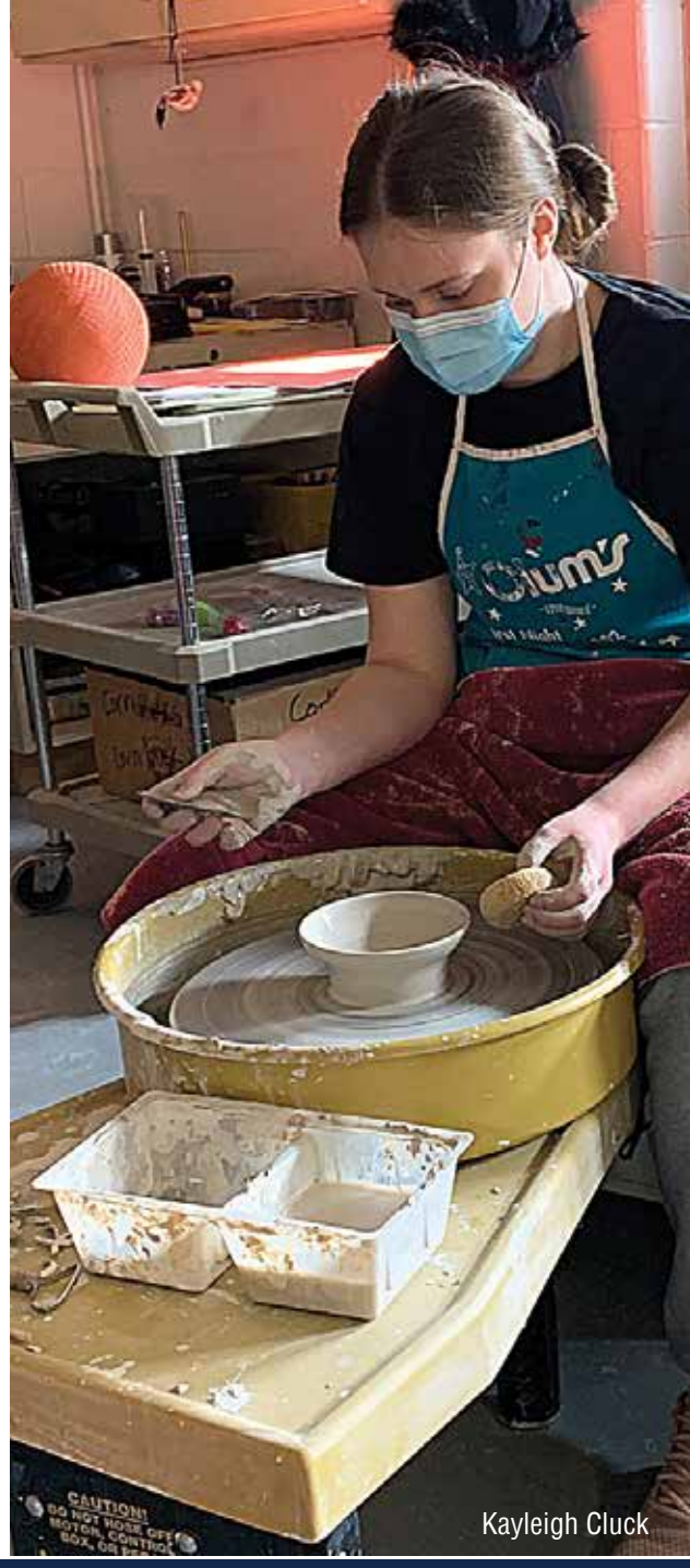
Harpursville Central School District